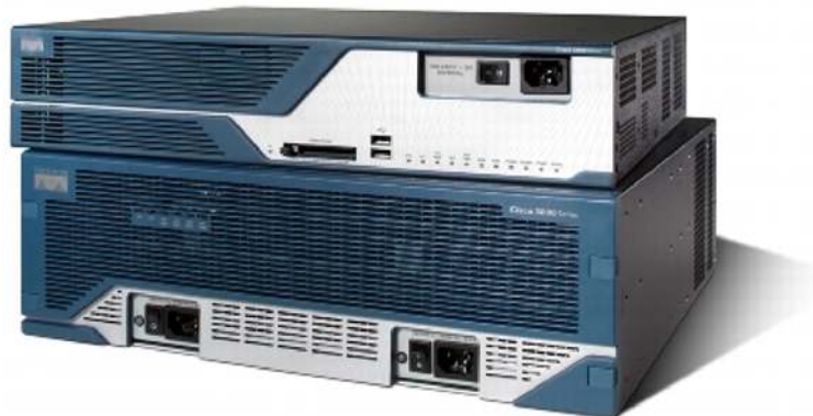
Figure 1. Cisco 3825 and 3845 Integrated Services Routers

The Cisco 3800 Series Routers feature embedded security processing, generous performance and high memory capacity, and high-density interfaces that deliver the performance, availability, and reliability required for scaling mission-critical security, IP telephony, business video, network analysis, and web applications in the most demanding enterprise environments. Built for performance, these routers deliver multiple concurrent services up to wire-speed T3/E3 rates.